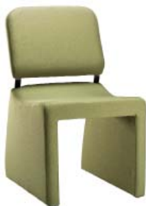
8000 A : 20" C : 19" E : 17"