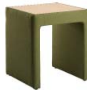
8000 T A : 17" C : 18 1/2"