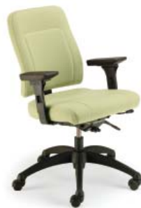
8001 A : 20" C : 17 - 21" E : 18 1/2"