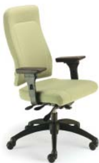
8002 A : 20" C : 17 - 21" E : 24"