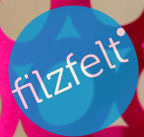
Polka 120 Light Drapery