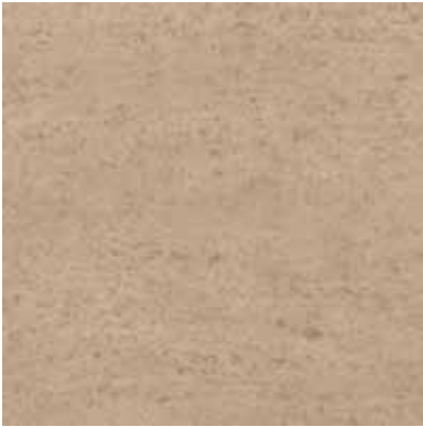
5515 Natural Stone