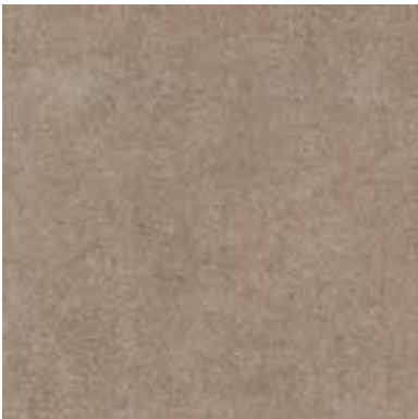
5520 River Rock