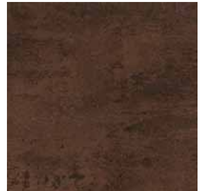
5521 Stained Concrete