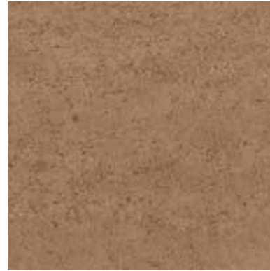
5517 Aged Stone