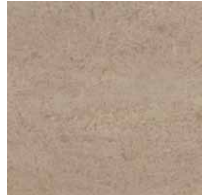
5516 Weathered Stone