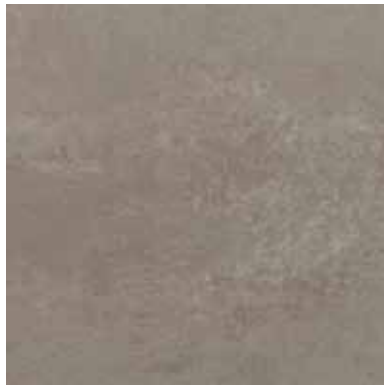
5522 Washed Concrete