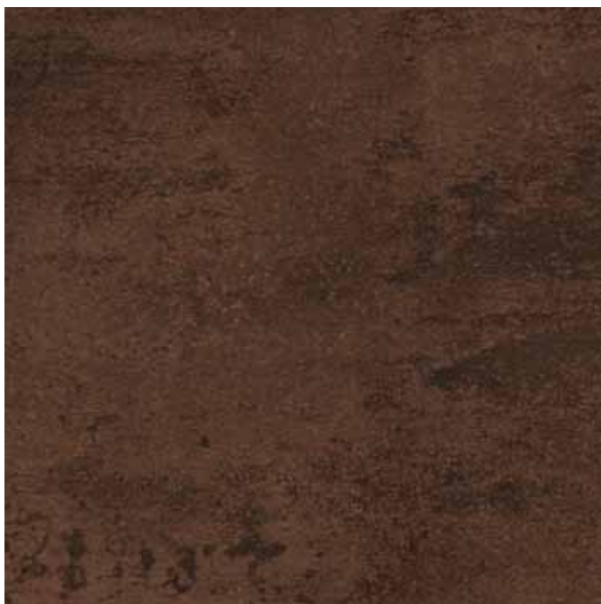
5521 Stained Concrete

The subtle tone-on-tone shades of Mother Nature are captured with Asento tiles. Verona, Tuscany, River Rock and other enduring patterns offer the luxurious appearance of time-honored stones and pavers with the practical features of luxury vinyl tile.