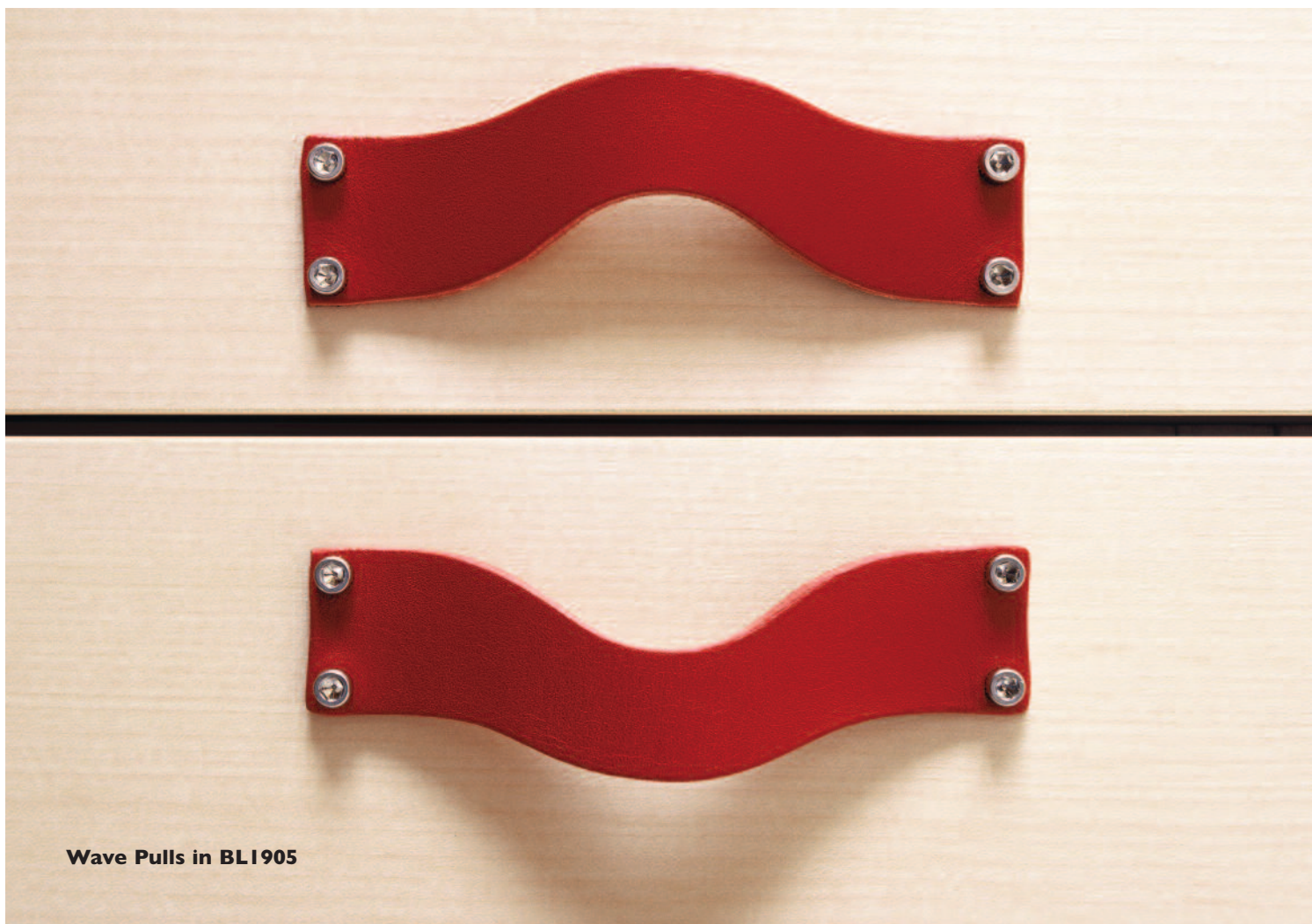
Wave Pulls in BL1905