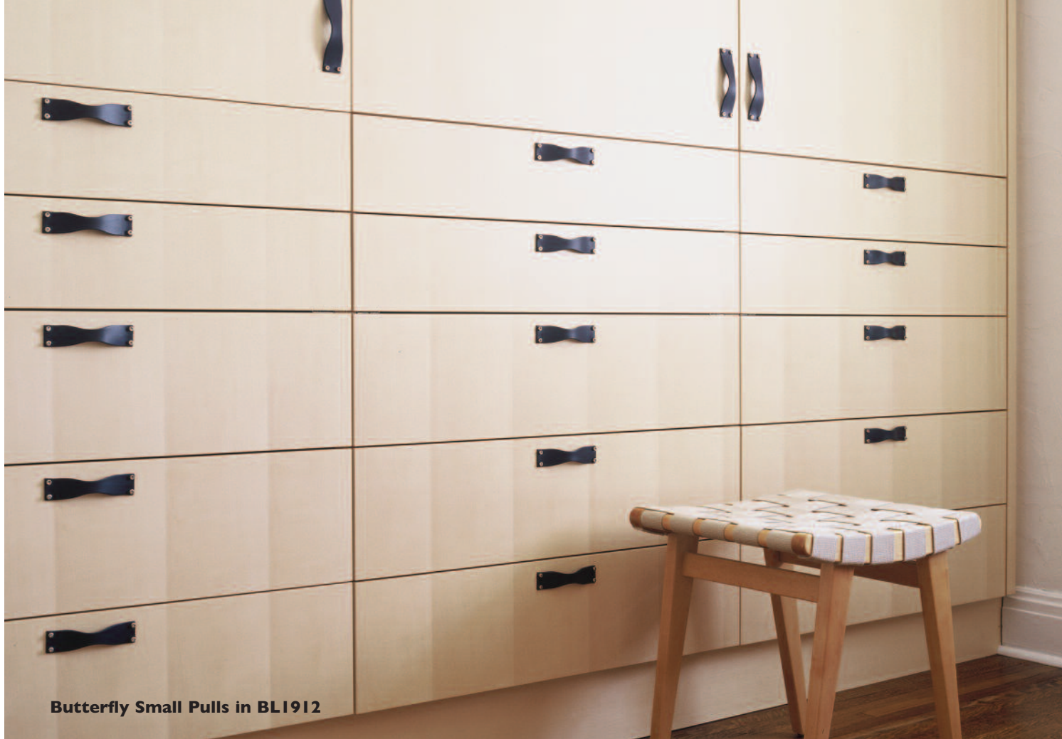
Butterfly Small Pulls in BL1912