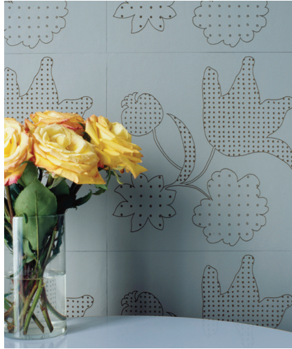
12" x 12" Portofino 2301 with custom Laser Engraved pattern by Emanuela Frattini Magnusson vertically installed