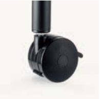
Optional locking casters