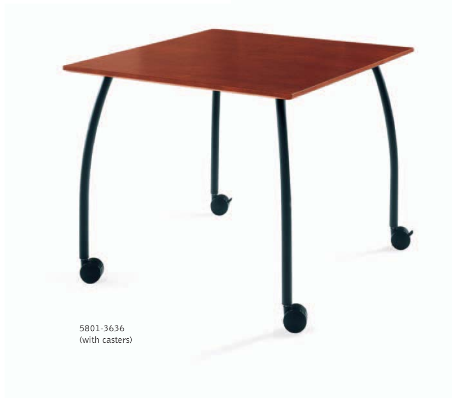
5801-3636 (with casters)

Can Can is an award-winning collection of tables and chairs that sets a new standard for aesthetic expression in practical form. Seamlessly combining wood and chromed tubular steel, Can Can tables help to create flexible but well-appointed spaces. In multi-purpose office environments that need to respond quickly to change, Can Can tables make an immediate, stylish impression, yet offer exceptional adaptability. Can Can is easily and quickly reconfigured allowing conference rooms, hospitality areas and team-based environments the flexibility of multi-use spaces.