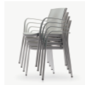
Stacking capability - up to 13 high