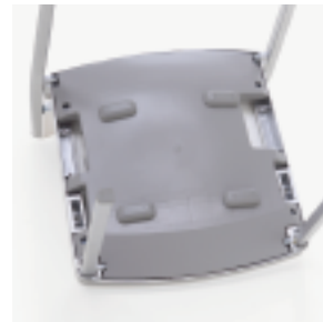
Underside of chair