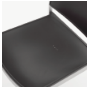
Perforated holes for outdoor drainage