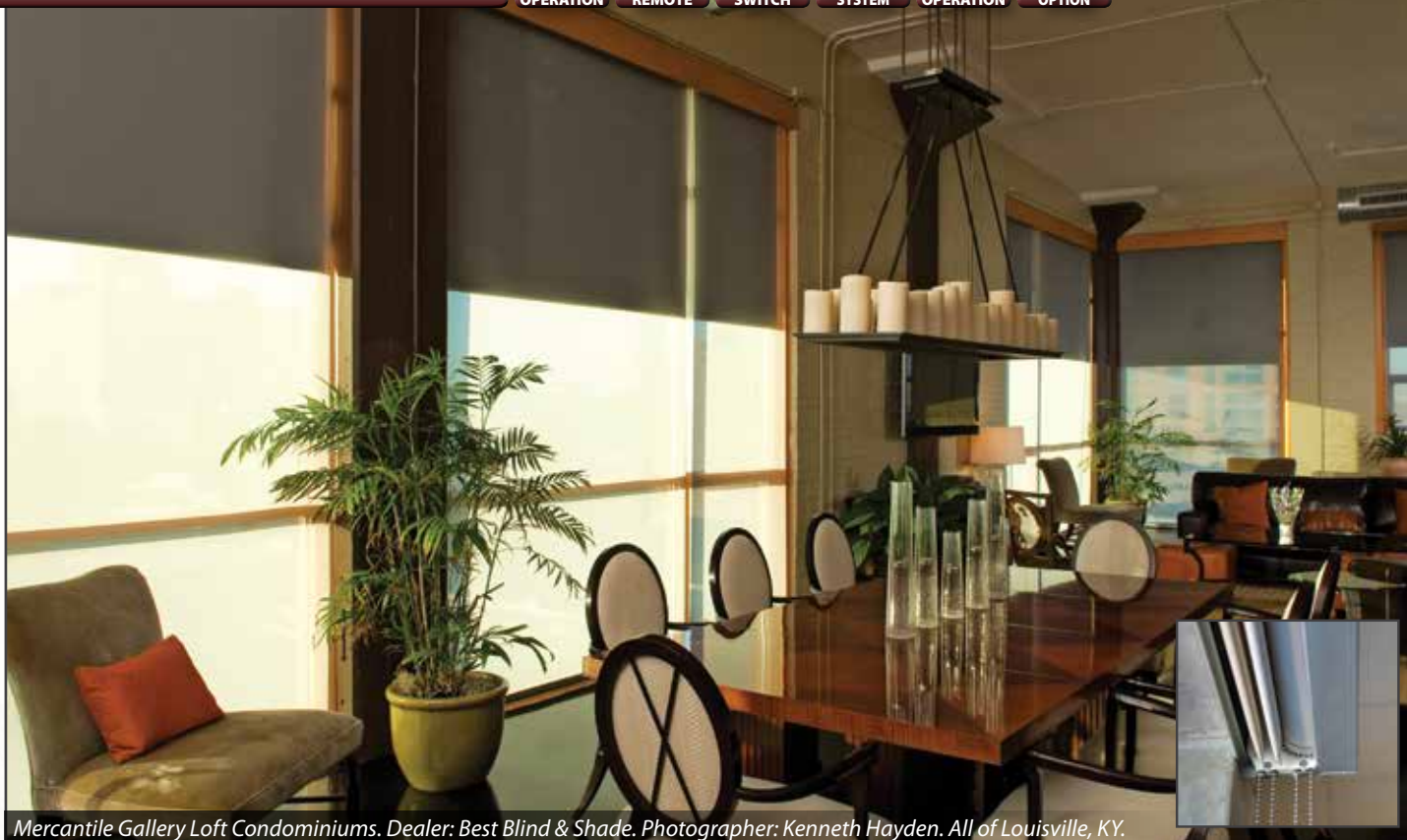
Mercantile Gallery Loft Condominiums. Dealer: Best Blind & Shade. All of Louisville, KY.