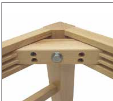
Corner Block System with Center Lag Bolt and Hardened Screws Note: Construction may vary from style to style.