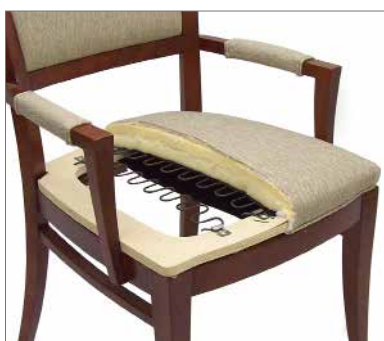
Sinuous Spring Seat