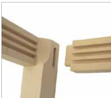
Mortise and Tenon Joints