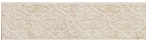
25902/L2.5x9 Baroque Alabaster Listello