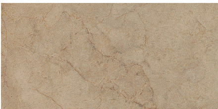
25926 Classic Beige