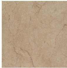
25926 Classic Beige