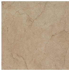
25926 Classic Beige

glazed ceramic wall tile (wall tile trim & decorative inserts have a gloss finish)