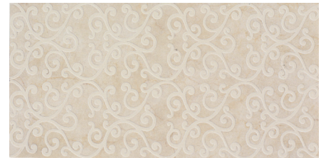
25902/D9x18 Baroque Alabaster