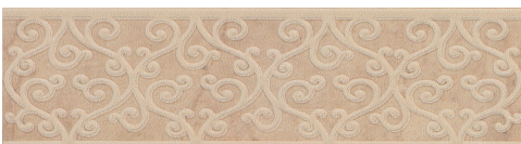
25926/L2.5x9 Baroque Classic Beige Listello