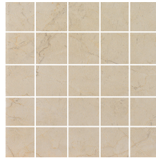
25902/M12 Alabaster Mosaic