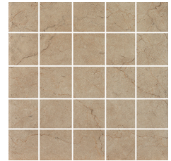
25926/M12 Classic Beige Mosaic