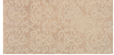
25926/D9x18 Baroque Classic Beige

Shown on Front: 25926 18x18 Classic Beige