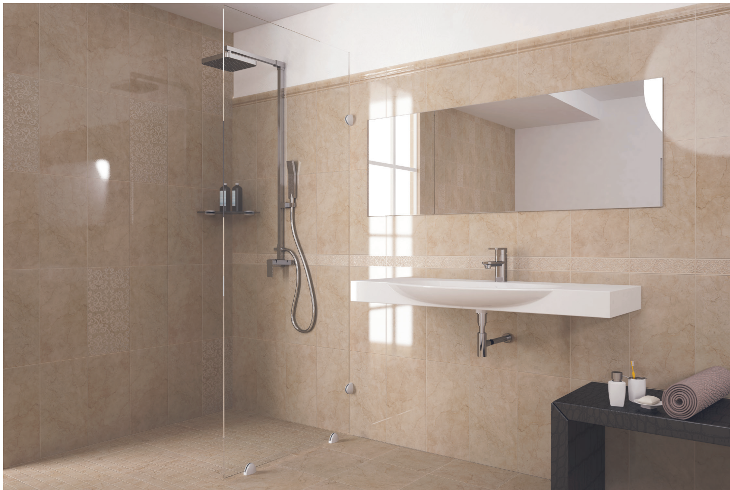
Shown: 25926 Classic Beige 9x18 & 12x12, 25926/L2.5x9 Baroque Classic Beige Listello , 25926/M12 Classic Beige Mosaic, 25926/CR2x9 Classic Beige Chair Rail