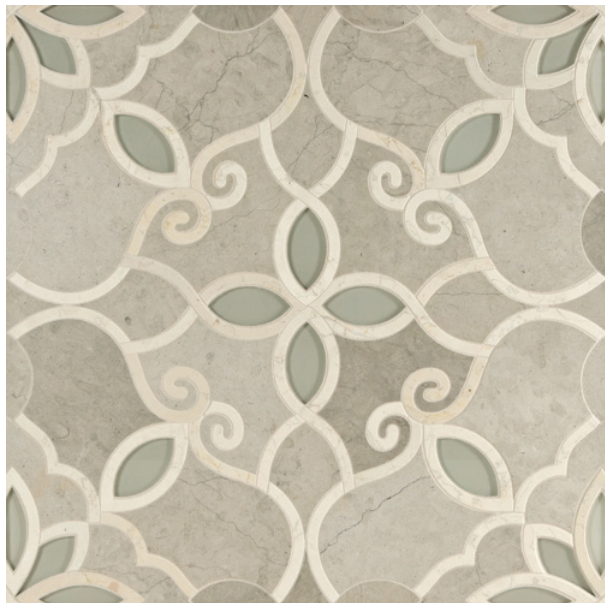
background: Smoke Honed lines: Bianco Antico Polished petals: Pearl Gloss Glass