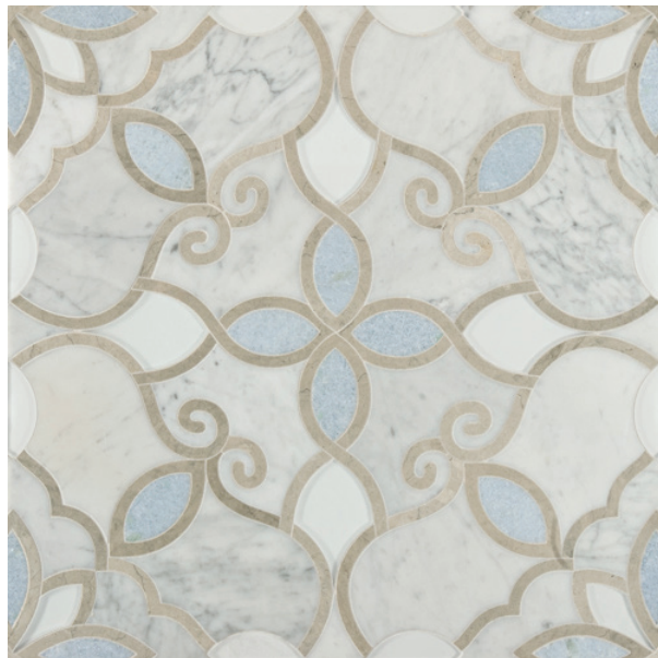
background: Bianco Carrara Polished lines: Smoke Honed petals: Azul Cielo Polished