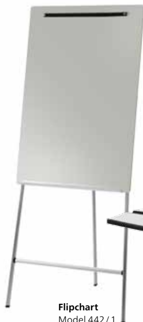
Flipchart Model 442 / 1