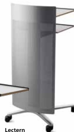
Lectern Model 448 / 9