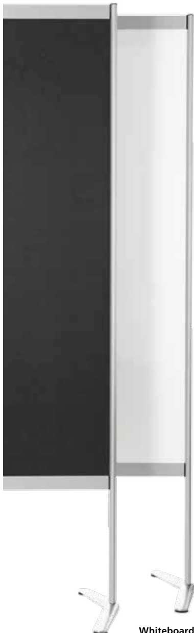
Pinboard Model 443 / 1

The Confair range is the perfect example of image building and innovative force combined. High-quality details, excellent materials and a distinctive design boost team spirit and the impression created. At the same time, the range's modular, easy-to-transport structure and innovative functional details encourage participation, personal organisation and interactive skills. And it saves on overheads for rooms and facility management to boot. It is no surprise that Confair has set an example in the industry worldwide as a new type of furnishing concept. In terms of function and superb design, it is a good choice for workshop, project, seminar and conference settings.