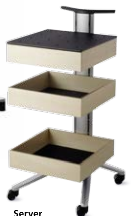
Server Model 446 / 3