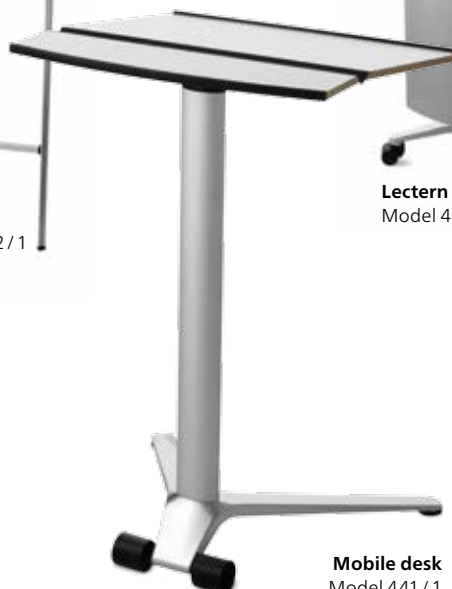
Mobile desk Model 441 / 1