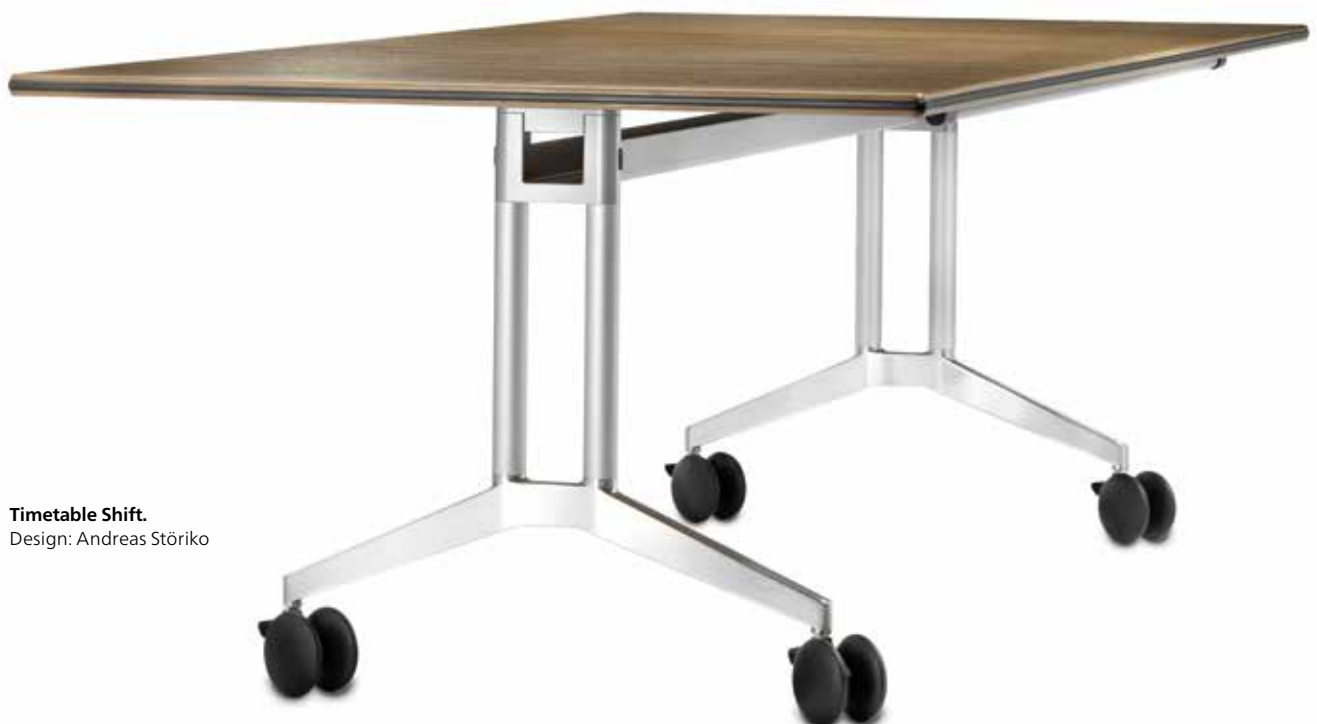
Timetable Shift. Design: Andreas Störiko

Timetable Shift combines Timetable's swivel-tabletop principle with the frame design of the established Logon conference table range. The signature uprights are topped out by a high-precision aluminium casting. Its dual function provides a stable bearer for larger tabletop sizes and a shoe for a spacious cable channel for connecting the table and multi-media equipment to the power supply. Substantial hinges allow wide surfaces to be safely tilted and an easy-to-use draw rod locks the tabletop horizontally or vertically. Specifiable in increments of five centimetres, formats of 150 to 210 centimetres in width and from 75 to 105 centimetres in depth are available to suit customer preferences. The applications are therefore limitless, from temporary work spaces, to tables for meetings or as conferencing systems. And what's more, Timetable Shift offers seamless solutions on demand by combining static Logon tables in suites that are sub-divided by folding partitions, extracting optimal performance from high-value communication-oriented space.