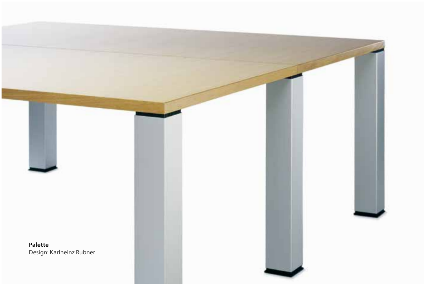
Palette Design: Karlheinz Rubner

The rigid blockboard tops do not require any underframes. This creates more legroom and allows space-saving stacking (like pallets) of any tabletops not currently needed. And what is more, in addition to mass-produced tabletops, the ingenious design allows customised tabletops – including integration of state-of-the-art multi-media equipment.