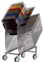
Trolley for transport and storage