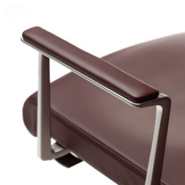
Armrest upholstered in soft leather