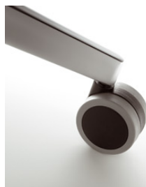
Castors (hard or soft)