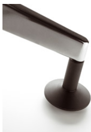
Glides with or without felt