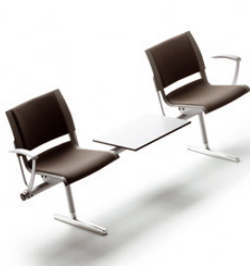
Side or intermediate table