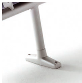
Floor fixing unit