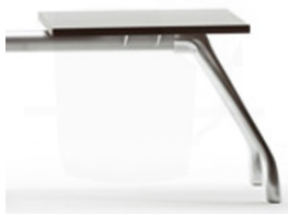
Side or intermediate table