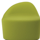
beach stone F w 32 d 24 h 26 sh 18