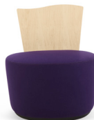
beach stone C w/ wood back w 25½ d 22½ h 27¾ sh 16½