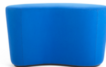
beach stone D w 38 d 24¾ h 24½