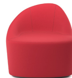
beach stone G w 32 d 24 h 31 sh 18