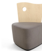
beach stone B w/ wood back w 23 d 26½ h 28¾ sh 14½