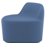
beach stone E w 32 d 24 h 25 sh 18

Five organic shell shapes give you the flexibility to customize your space.