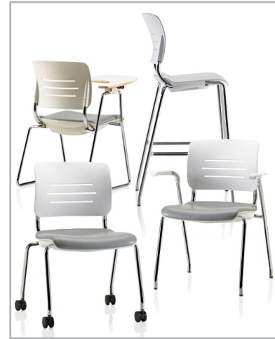
Grazie Collection designed by Giancarlo Piretti

4-leg chairs may be ordered with casters instead of glides (not available on café stools). Casters are double-wheel high-impact thermoplastic, available with hard or soft wheel surface, in black only.