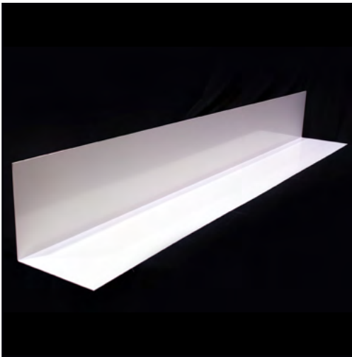
A910/25 90° external corner 8in x 8in x 8ft with 90° bend