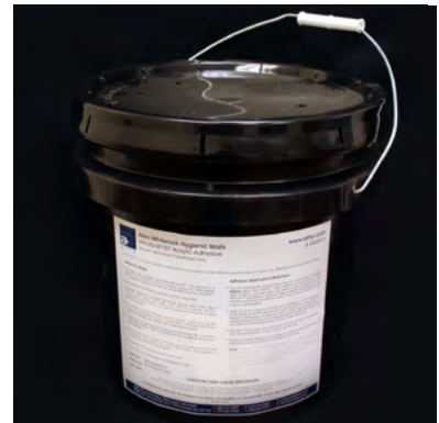
Altro W157 adhesive