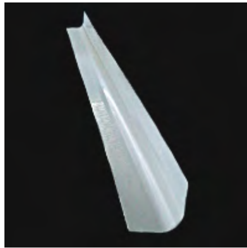
A930/25 R shape internal radius corner 8in x 8in x 8ft with 2" radius bend