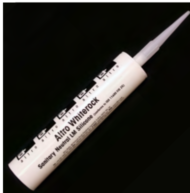
Altro Whiterock sanitary sealant