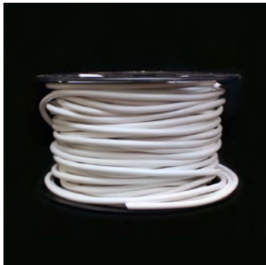
Weldrod diameter 0.16in x 900ft