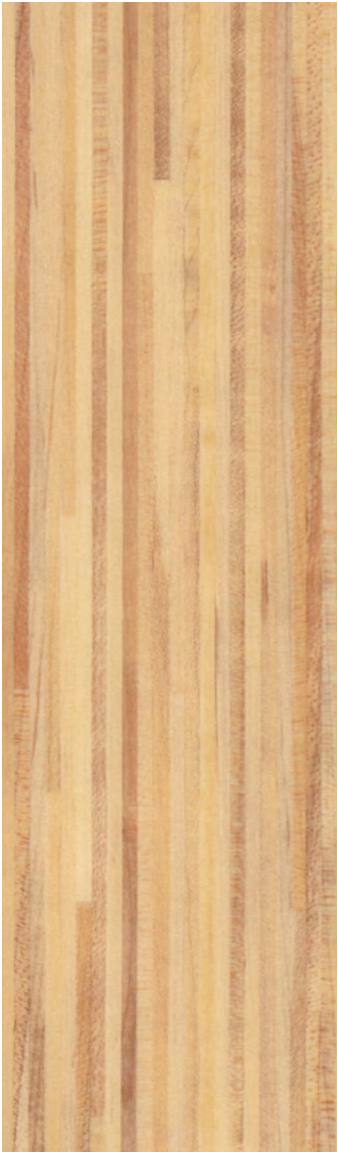
Bichd. Bamboo Acoustic WSMA3797 WR463 / AM392 LRV 42