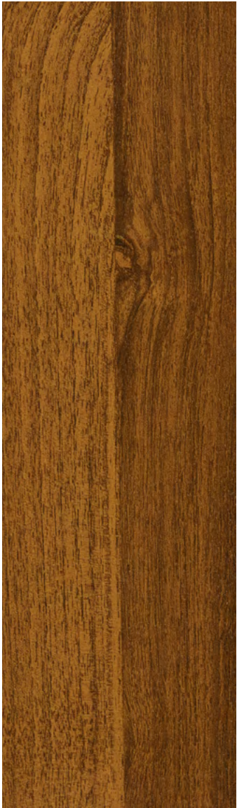
Antiq. Walnut Acoustic WSMA3782 WR341 / AM160 LRV 15