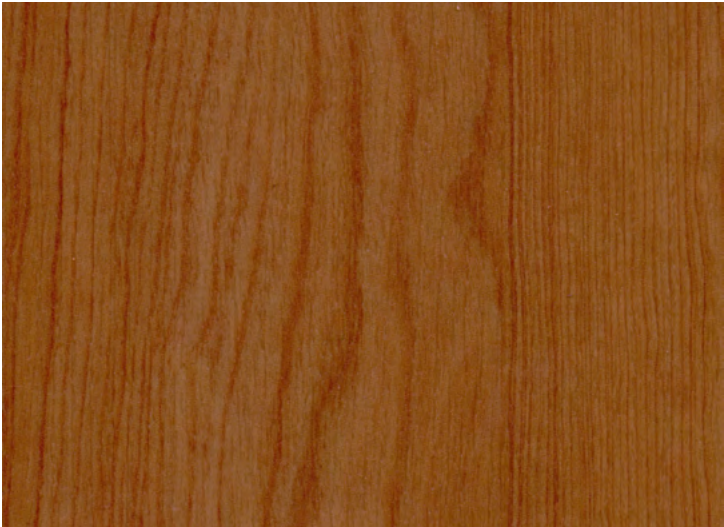
Mellow Maple Acoustic WSMA3795 WR352 / AM352 LRV 27