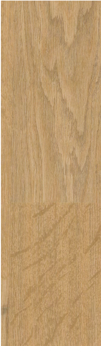
Farmhouse Oak Acoustic WSMA3781 WR338 / AM27 LRV 38