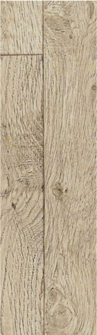
Castle Oak Acoustic WSMA3798 WR335 / AM335 LRV 51