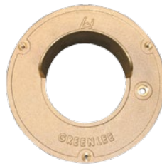
Directional Shield (DSA/B) Increased Light Control