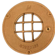
Rock Guard (RGA/B) Lens/Lamp Protection