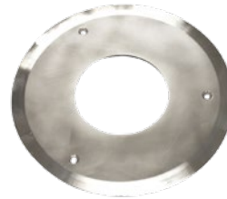
Stainless Steel Trim (SST) Decorative Appeal