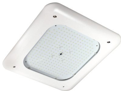
For Use on Water-tight Plenum Canopies