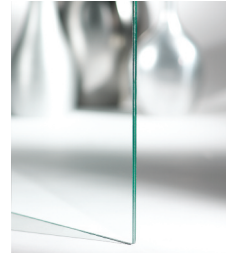
1/4" Clear Laminated CHIP-GLASS-GLB