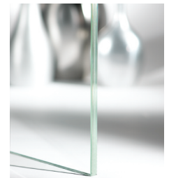
1/2" Low Iron Clear Laminated w/ .030 Interlayer CHIP-GLASS-GLI