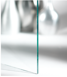
1/4" Clear Tempered CHIP-GLASS-GLA