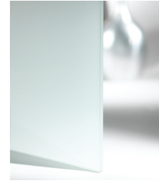
1/4" White Laminated CHIP-GLASS-GLC