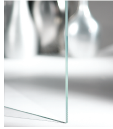
1/4" Low Iron Clear Tempered CHIP-GLASS-GLM