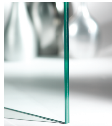
1/2" Clear Laminated w/ .030 Interlayer CHIP-GLASS-GLU