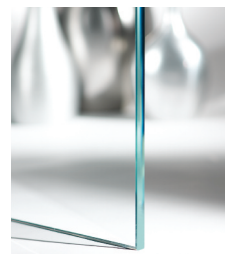
1/2" Low Iron Clear Tempered CHIP-GLASS-GLY