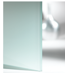
3/8" White Laminated CHIP-GLASS-25 I (GS0251)