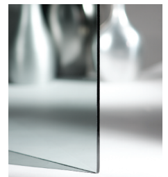
1/4" Grey CHIP-GLASS-GRY (GS0081)