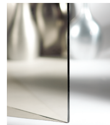
1/4" Bronze CHIP-GLASS-BRZ (GS0091)