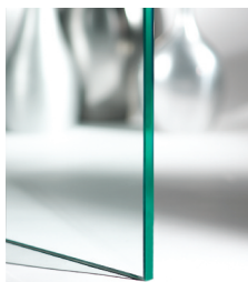
1/2" Clear Tempered CHIP-GLASS-GLT