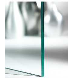
1/2" Clear Laminated w/ .030 Interlayer & Acoustic Layer CHIP-GLASS-GLX