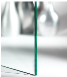
3/8" Clear Tempered CHIP-GLASS-23 I (GS0231)