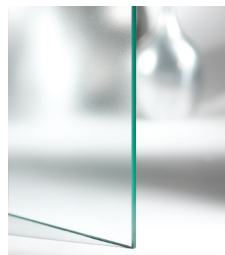
1/4" Light Satin Etch CHIP-GLASS-GLL