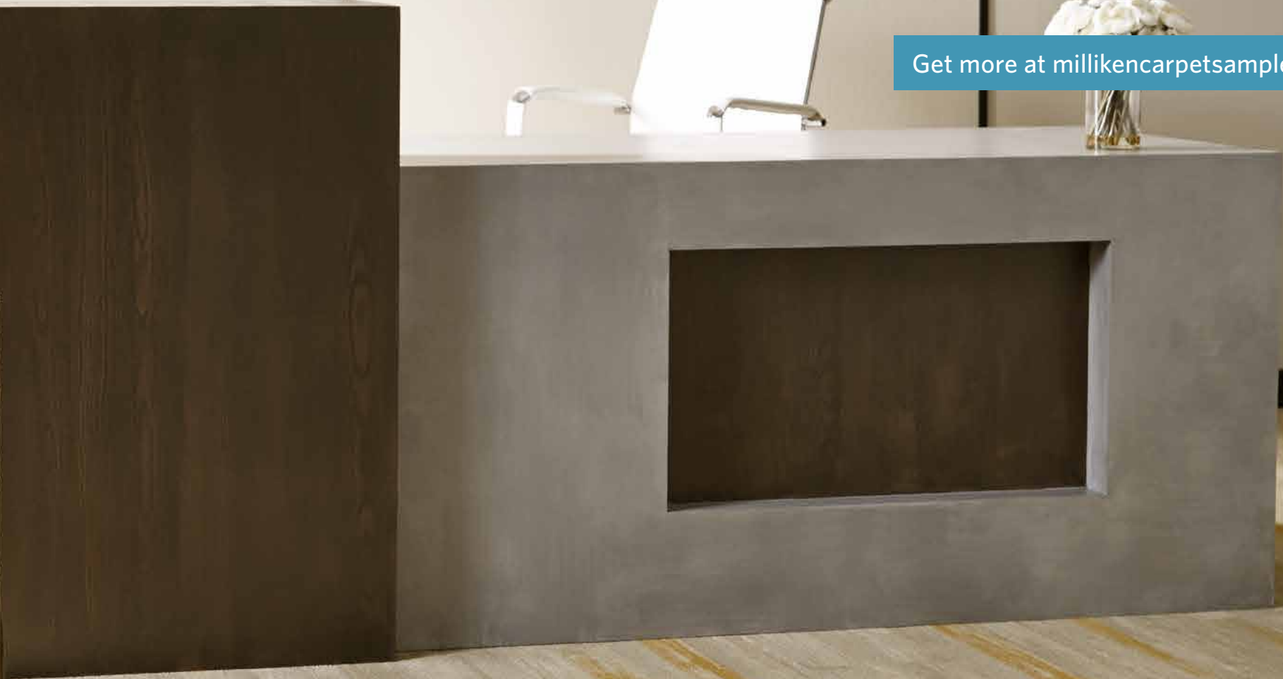
Color Field in New Silver and Pastel Grey, 25cm x 1m ashlar tile installation