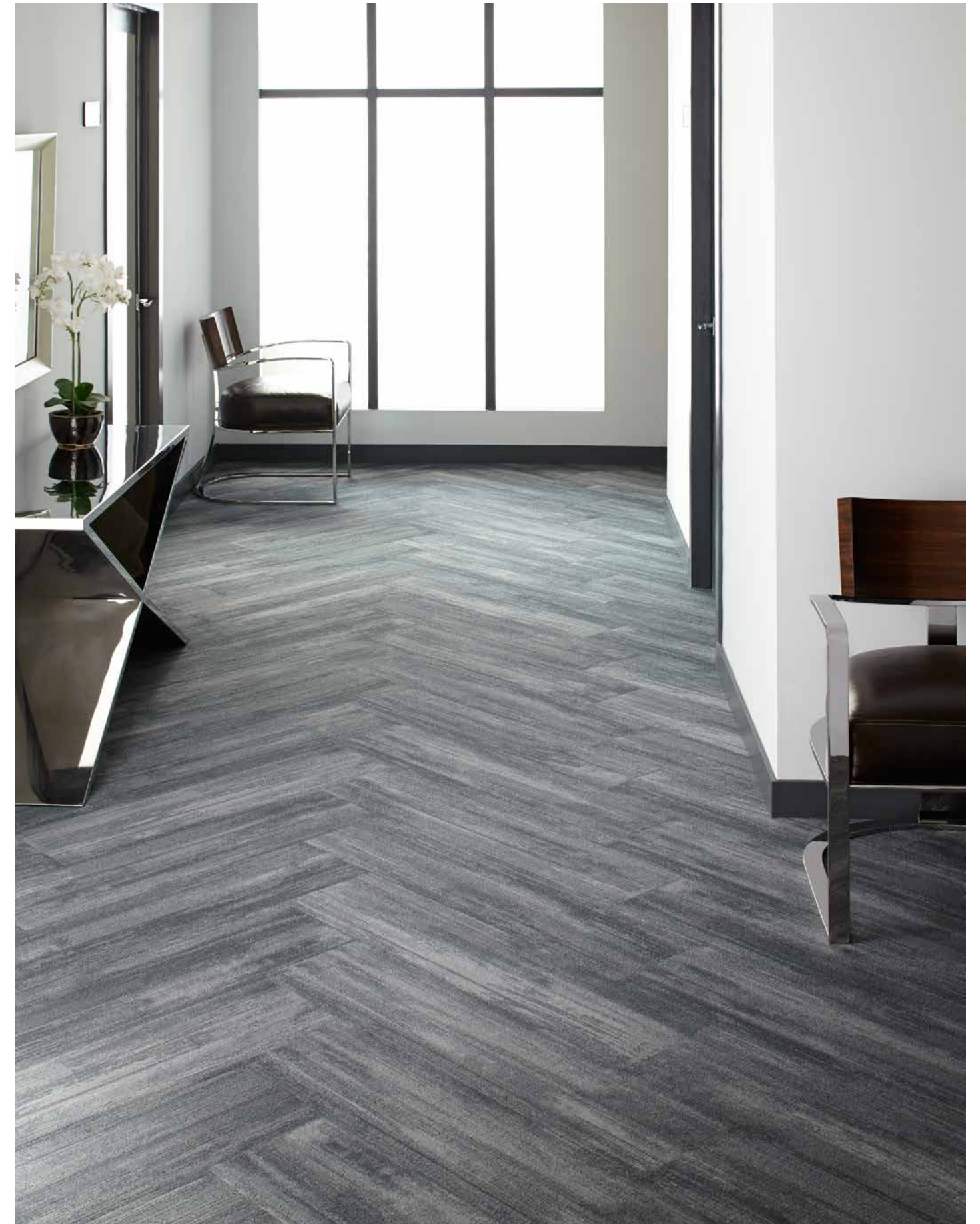
Color Field in Rune, 25cm x 1m herringbone tile installation