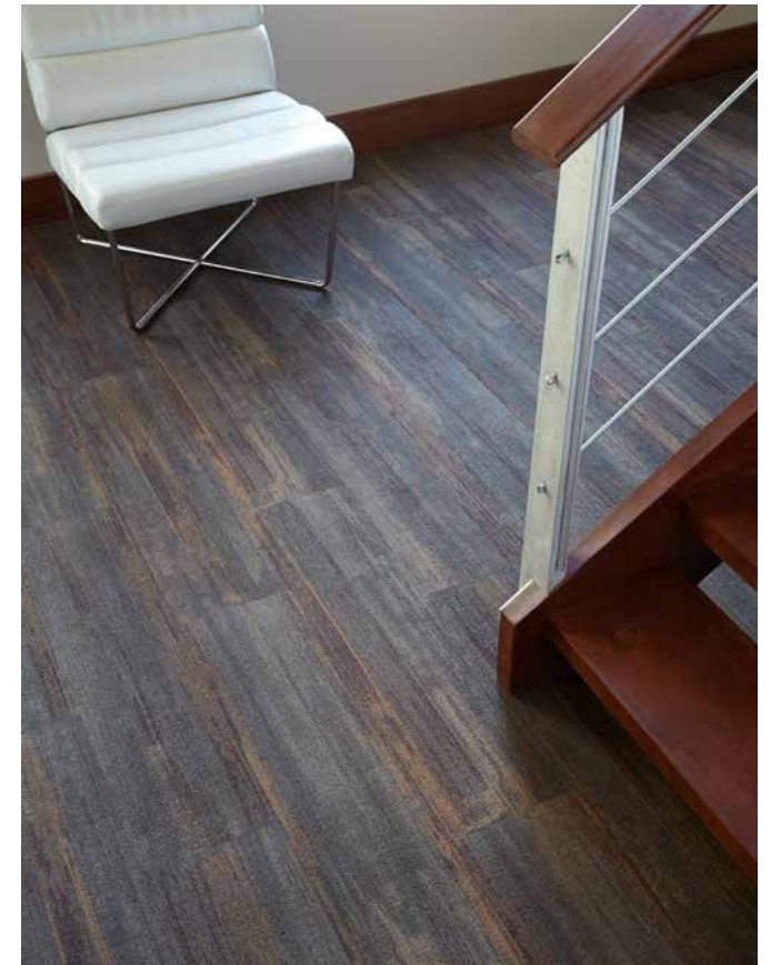
Color Field in Sorrel, 25cm x 1m ashlar tile installation