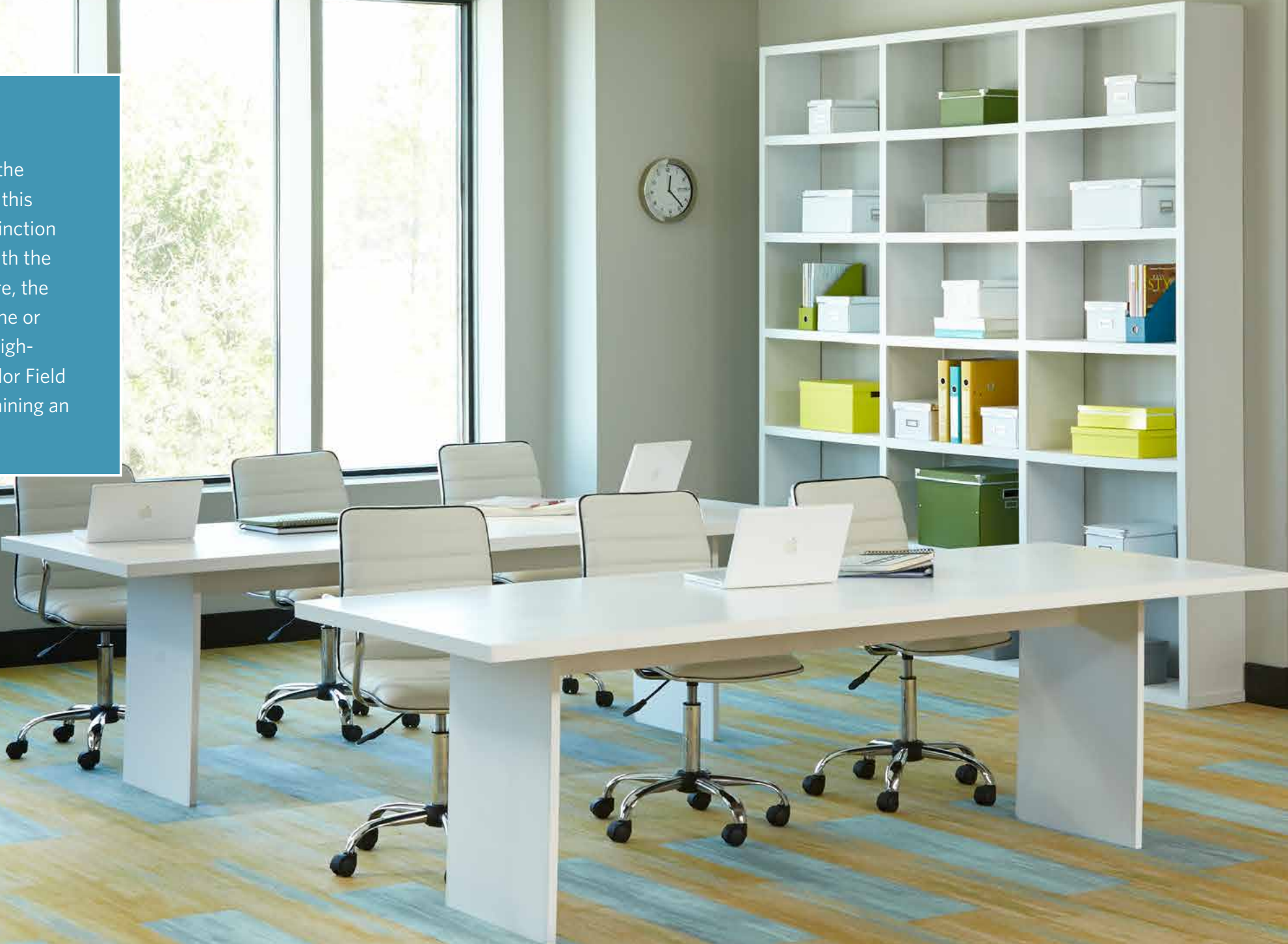
Color Field in Aqua Smoke and Streamside, 25cm x 1m ashlar tile installation

Inspired by the large swaths of color represented in the abstract expressionism style of 'color field' painting, this collection explores the details created when the distinction between subject and background are eliminated. With the ability to discern layers as if they were aged by nature, the collection offers 64 colors to create a quiet floor plane or allow punctuations of color with vibrant hues. This high-performance, severe-rated modular plank allows Color Field to stand-up to the most extreme traffic while maintaining an imaginative color palette.