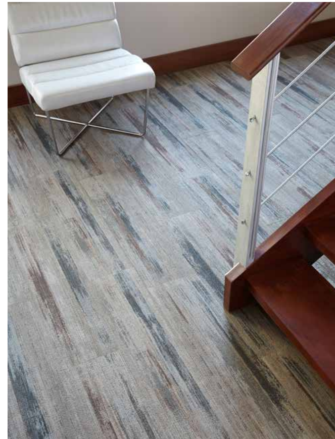
Color Field in Granite Moss, 25cm x 1m ashlar tile installation