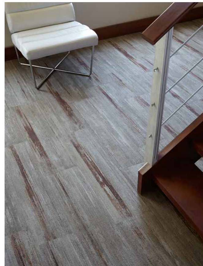
Color Field in Barnwood, 25cm x 1m ashlar tile installation