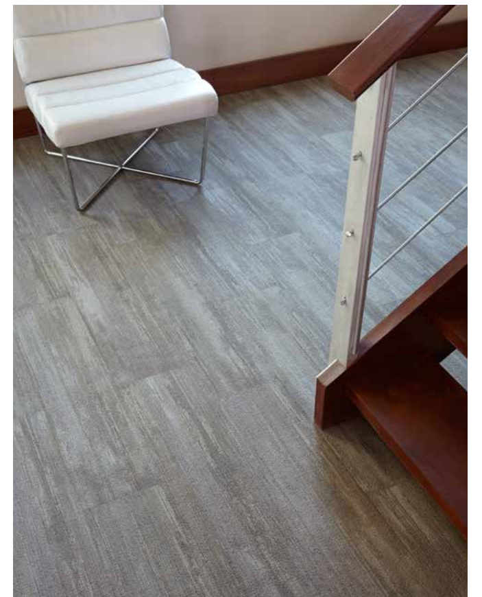
Color Field in Birch Shadow, 25cm x 1m ashlar tile installation