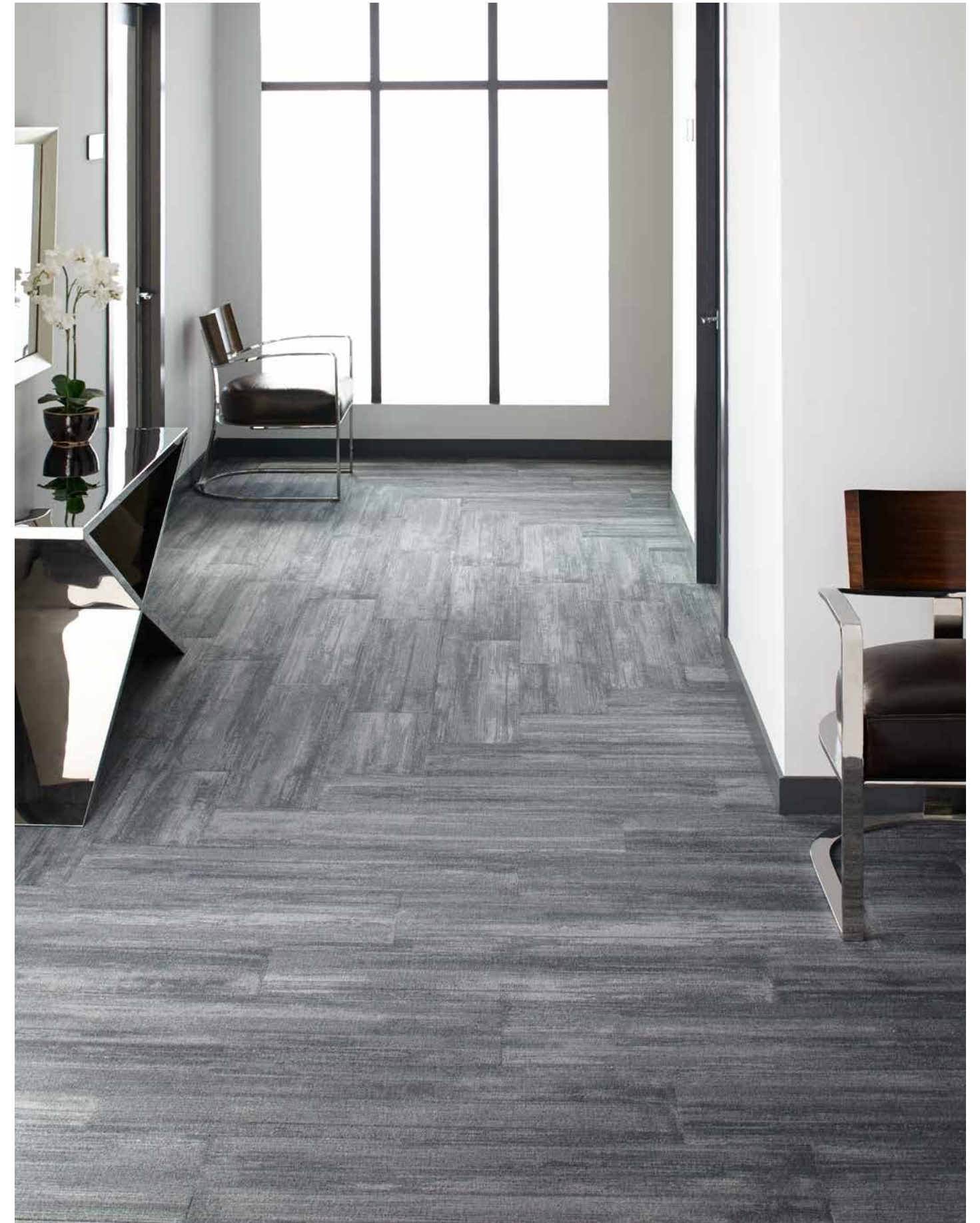
Color Field in Rune, 25cm x 1m ashlar tile installation