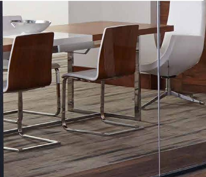
Color Field in Granite Moss, Sorrel, Barnwood, and Birch Shadow (left to right), 25cm x 1m ashlar tile installation

Dramatic color creates life when there is no distinctive figure to distinguish where one form ends and another begins. Respectful of the boundary, yet driven by the need to explore something larger, our perspective is shaped by the entirety of the canvas, be it one of smooth linen or rough-hewn board.