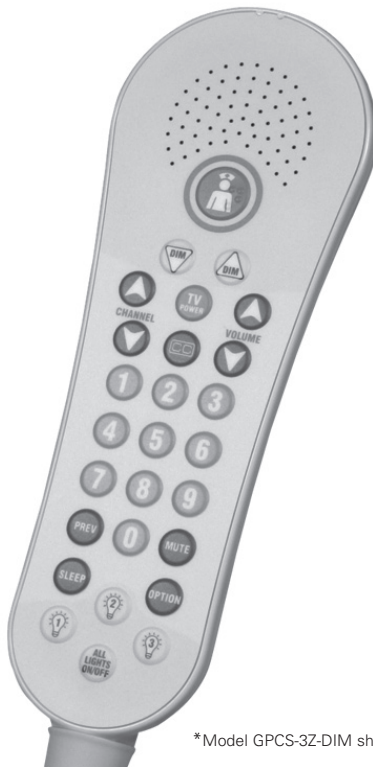
*Model GPCS-3Z-DIM shown