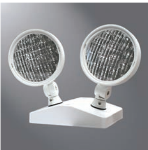
RF LED - REMOTE