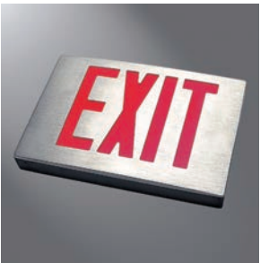
RXD - EXIT SIGN