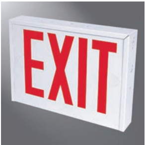
RXS - STEEL EXIT SIGNS

COMPLIANCES: UL924 Listed; Damp Location, NYC Code Compliant