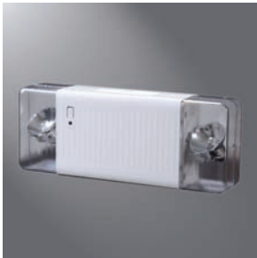
PC1-10 CONTOURS EMERGENCY LIGHT

Compliances may not apply to all product configurations. Please consult the product spec sheet for compliance details. COMPLIANCES: UL924 Listed; Damp Location