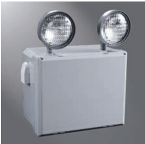
X SERIES NEMA EMERGENCY LIGHT

Compliances may not apply to all product configurations. Please consult the product spec sheet for compliance details. COMPLIANCES: UL924 Listed; NFPA 101 Compliant