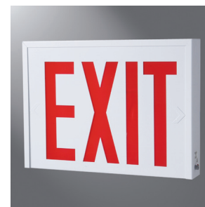
XLA1, XLN1 LED EXIT SIGN