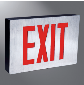
XLA2, XLN2 LED EXIT SIGN