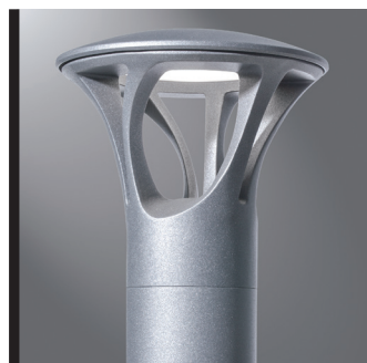
ABB ARBOR BOLLARD