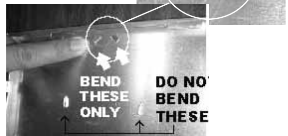
Illustration 3 & 4