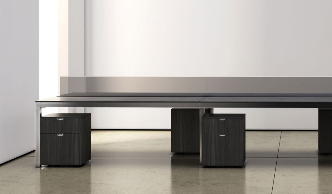
LEX bench in Slate Walnut, polished aluminum and smoked glass with mobile storage.