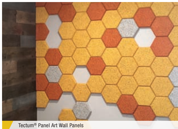
Tectum® Panel Art Wall Panels