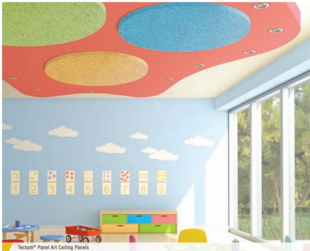
Tectum® Panel Art Ceiling Panels