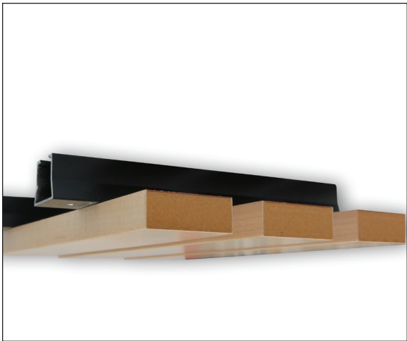
PANELIZED LINEAR WOOD