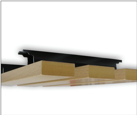
LAY-IN LINEAR WOOD