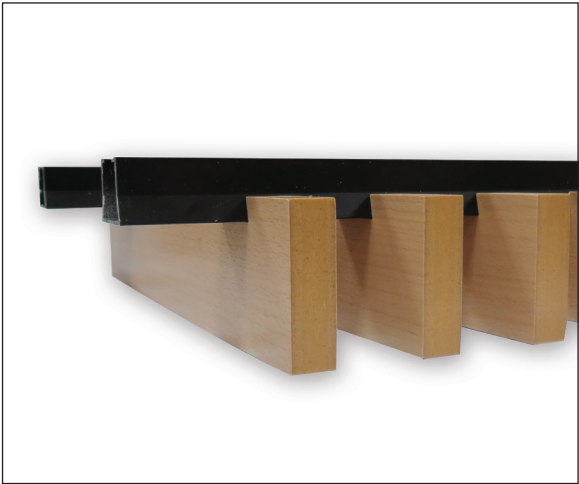
CROSS PIECE GRILLE