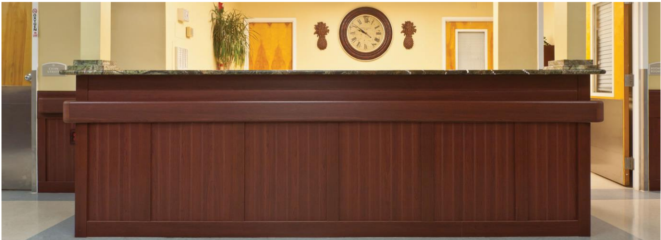
White Oak Manor Palladium 3D | 800W Handrail