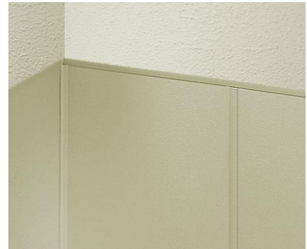
Rigid Sheet | Solid Colored Trim