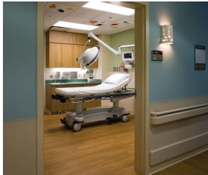
Pediatric Wing IPC Rigid Sheet | 3000 Handrail Custom Door Frame Guard