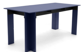
navy blue: SC-HT65-NB