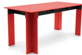
apple red: SC-HT65-AR