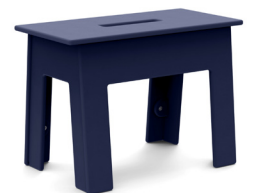
navy blue: ST-HS-NB