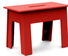
apple red: ST-HS-AR