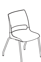
DNC100 (Fixed-Back Wallsavers)