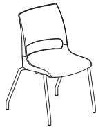
DNC100 (Fixed-Back Wallsavers)