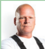
Mike Holmes Trusted contractor and host of the hit TV series Holmes on Homes ®, Holmes Inspection , and Holmes Makes It Right

"CertainTeed AirRenew® drywall helps remove unwanted chemicals from indoor air even years after the construction is done. AirRenew is ahead of the game. It tackles indoor air quality issues head on."