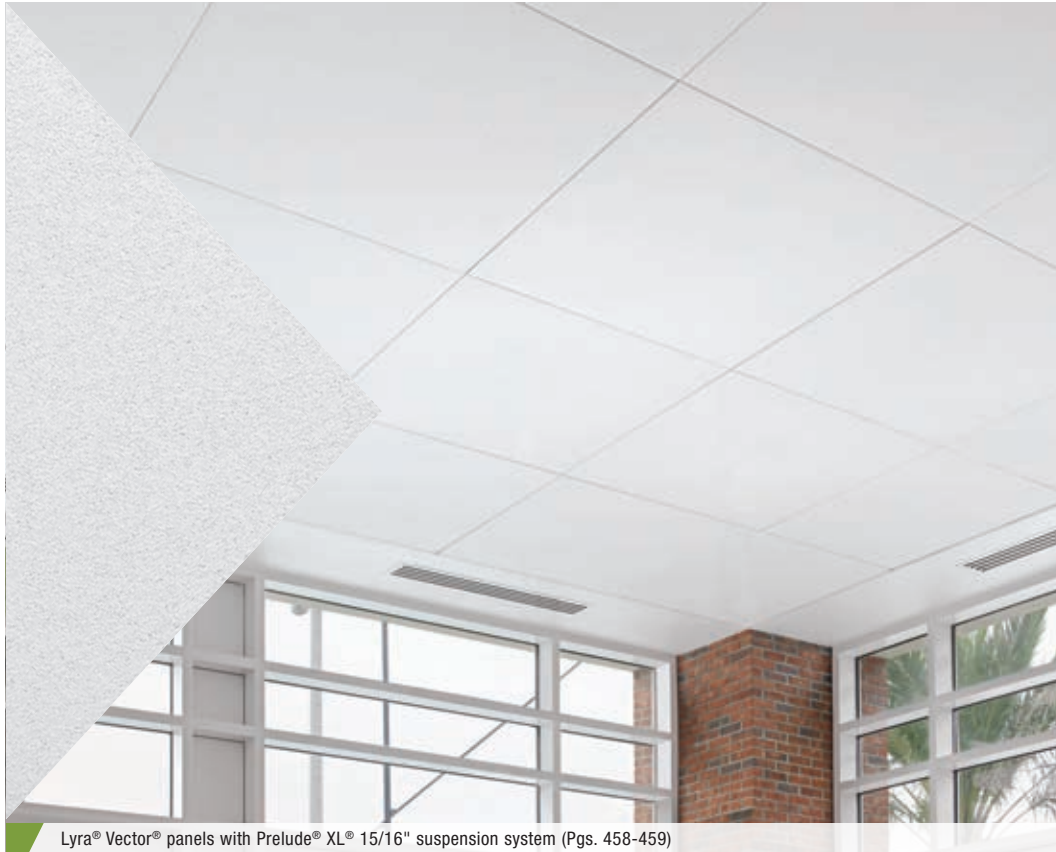
Lyra® Vector® panels with Prelude® XL® 15/16" suspension system (Pgs. 458-459)

Mix and match different sizes, colors, and materials to reinvent your ceiling. More at: armstrongceilings.com/designflex