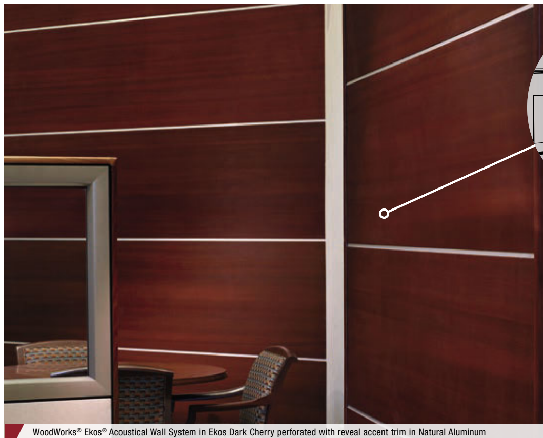
WoodWorks® Ekos® Acoustical Wall System in Ekos Dark Cherry perforated with reveal accent trim in Natural Aluminum

CAD/Revit® drawings at: armstrongceilings.com