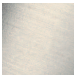
Brushed stainless steel / platinum matte