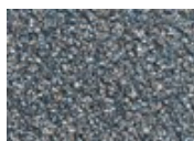
565 Regenerated Indigo