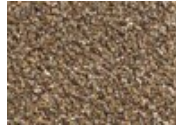
876 Distinct Olive