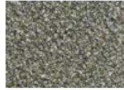
665 Refreshed Green