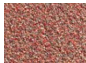
341 Brightened Red