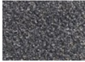
599 Pronounced Navy