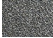
885 Latest Slate