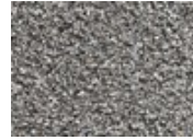
927 Revived Ash