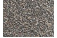
978 Keen Gray