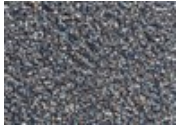
575 Renewed Blue