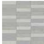
BL-Dark Blend: Mist, Mica, Fog