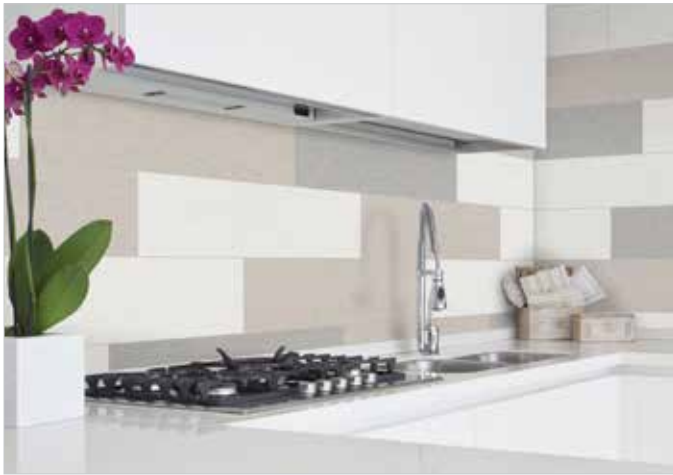
Belgian Linen Fog, Ivory, Mist, Mica &amp; Natural