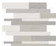
BL-Light Blend: Ivory, Natural, Fog