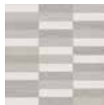
BL-Light Blend: Ivory, Natural, Fog