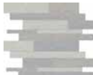
BL-Dark Blend: Mist, Mica, Fog