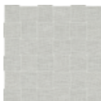
Random Strip Mosaic