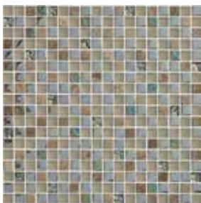
*SL-HARVEST 9/16" x 9/16" MÉLANGE