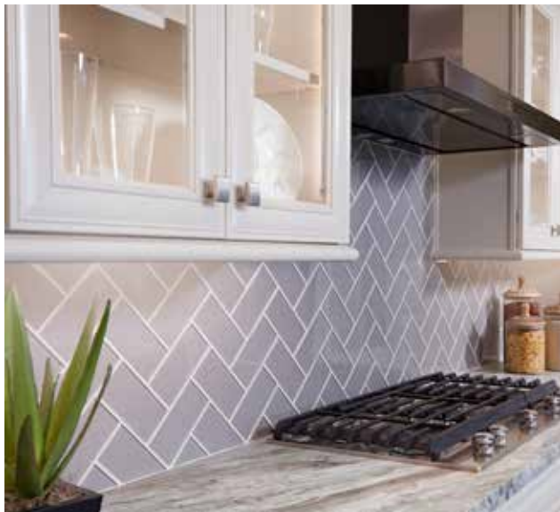
SL-FOG 3 x 6 STAG JOINT (custom install)