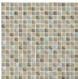
*SL-COTTAGE 9/16" x 9/16" MÉLANGE