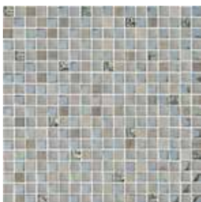
*SL-LUNAR 9/16" x 9/16" MÉLANGE

The Skylights glass line is made from 8mm high quality, heavy duty, construction-grade glass, which is usually used for commercial windows in high-rise office buildings and hotels. The first step in the process to make Skylights is the coloring of the glass. The coloring is made up of color pigments mixed with metal oxides that are applied on one side of the glass sheets using a screening process that applies an evenly distributed layer across the entire surface. After completely air-drying, the larger sheets are then cut to their final size. Those pieces are then transferred to the appropriately sized kiln plates and fired at 1,472-1,580°F. The time for firing varies from 30-60 minutes, depending on the size and thickness of the glass. The firing process performs two tasks: it bonds the color to the glass chemically with the heat, and it also softens the cut edges of the tile to give you that pillowed effect atop each tile. After firing, the tiles are placed top-down in trays and then a special glue is applied with silk-made mesh that is cut to the size of the tray (approximately 12"x12").