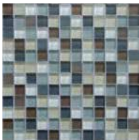
SL-COSMOPOLITAN MÉLANGE 1" x 1"