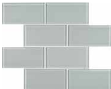
SL-FOG GLOSSY 3" x 6" Stag Joint Glossy

***1" x 1" Melange and 1/16" x 9/16" Melange only